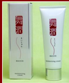
Fig. 1 Maitake cream 舞潤 ® (MaiJun) is a cream containing 0.2% Maitake ethanol extract (Gripin ® ).

Sixty xerosis patients (25 males and 35 females, 75-97 years old) and fifteen healthy volunteers (6 males and 9 females, 23-63 years old) were initially enrolled in the trial. Twelve and thirty-five patients completed the entire 1- and 5-week treatment (once a day) with 0.2% Maitake cream, respectively. All healthy volunteers completed the 4-week (28 days) treatment (three times a day) with 0.2% Maitake cream. Evaluation of treatment benefit was based on measurement of skin desquamation for the patients, and that of skin surface sebum and water content of stratum corneum using Corneometer CM825PC.