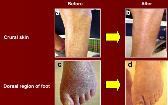
Fig. 2 Maitake cream is responsible for the cure of xerosis Data show a male patient (77 years old) with moderate xerosis (panels a and c, Before). When the crural region and dorsal region of the feet of the patient were treated once a day with Maitake cream for 1 week, the skin condition was improved (panels b and d).

These results suggest that the Maitake cream is useful for not only remission and/or cure of xerosis but also enhancement of moisturization in healthy skin by the mechanism whereby the Maitake extract augments sebum production to restore the cutaneous barrier function.